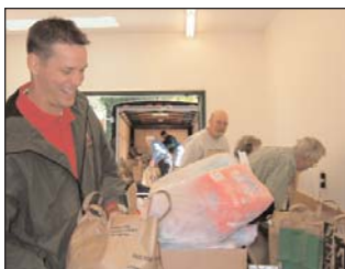
Generous lifestyles of giving and service must first be modeled with elders and staff.