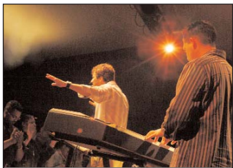
Every week Fellowship Bible Church talks about the value of generosity.