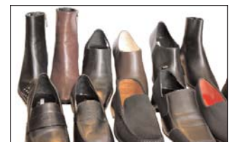
2,000 pairs of shoes were given to people in Peru, Africa one Sunday when a whole church moved together in one moving act of generosity.

“Our church was able to donate more than 2,000 pairs of shoes to people in Peru, Sudan, Mississippi and an African village that requires children to wear shoes to go to school. We received the shoes when our pastor one Sunday morning asked for everyone to donate the shoes they had worn to church,” Neal says. “It was a practical application of giving without worrying about tax receipts, but just responding in a moment to God’s call. Even children, who saw their parents without shoes, donated their shoes. (See the background and unfolding of Fellowship Bible’s “shoes” event in “Secrets of Generous Churches: Developing a Culture in which Serious Stewardship Is Normal” by Liz Swanson, available at http://www.leadnet.org .)