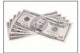
Money was such a difficult subject, but it didn’t need to be.

“We had so many ministries in a growing church that were crying out for help, so it would have been easy to move stewardship to the back burner, but our senior pastor really made it a