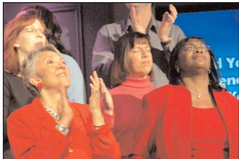
The really wonderful thing is that everyone at Central Christian knew that God was working as they began to embrace generosity.

“There was a lady at our church who was going to get a $1,300 tax return, and she really wanted a massaging chair. We were in our end-of-the-year campaign for the children’s area, and she decided instead of spending that money on the chair, she would give $1,000 to the campaign. A friend called her and sold her the exact same chair for $300.