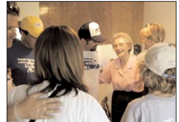
At Redeemer Presbyterian the stewardship ministry is run through small groups.